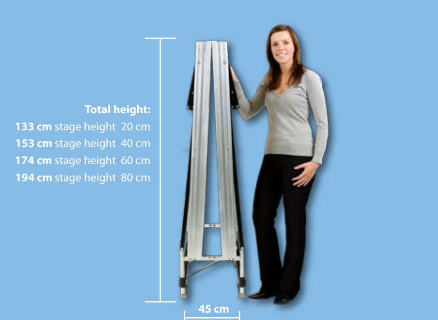
Step 2 - Unfold it:

Quick to set up thanks to robust mechanism.