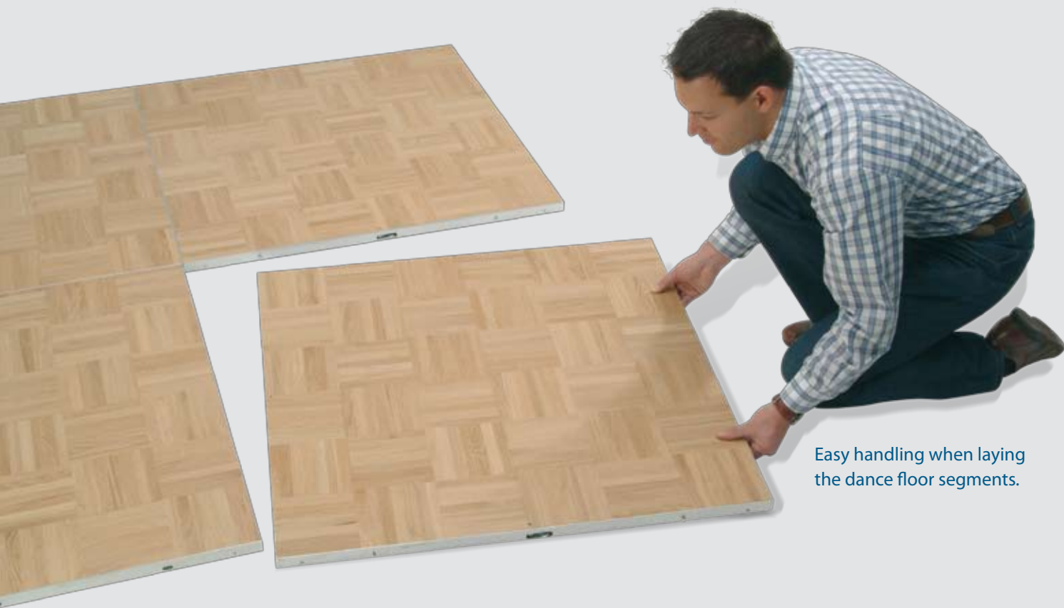
Easy handling when laying the dance floor segments.

Lay your own mobile oak parquet dance floor in next to no time